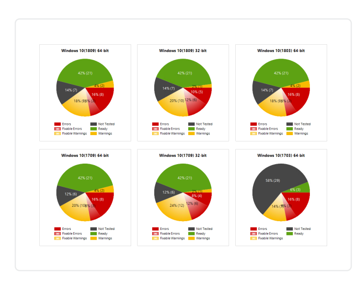
AdminStudio provides reporting for all supported versions of Windows 7, 8, 10 and Server

packages by status. Compatibility testing and reporting are provided for all supported versions of Windows 10 as well as Windows 7, 8 and Server.